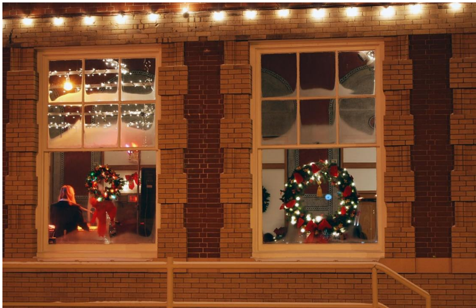
The Livingston Depot is arguably the most iconic building in Park County, hosting community events October through April and museum exhibits from May through September.

The second grant, of $5,000, was made to the Livingston Depot Foundation in Livingston, Montana to repair the historic windows in the NP Livingston depot. Decades of caulking, painting, and repair have been unable to stop the deterioration of the muntin bars due to moisture build-up and environmental conditions. Heat loss through leaky sashes and air gaps greatly decreases the energy efficiency of the building and increases utility costs for the nonprofit depot foundation. Finally, the half-dozen storm windows that remain on the Depot building have rotted sills, and buckled storm sashes.