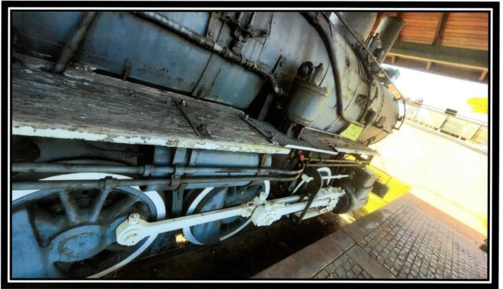
Northern Pacific No. 1031 class L-7 0-6-0 steam engine deteriorating wood on side.