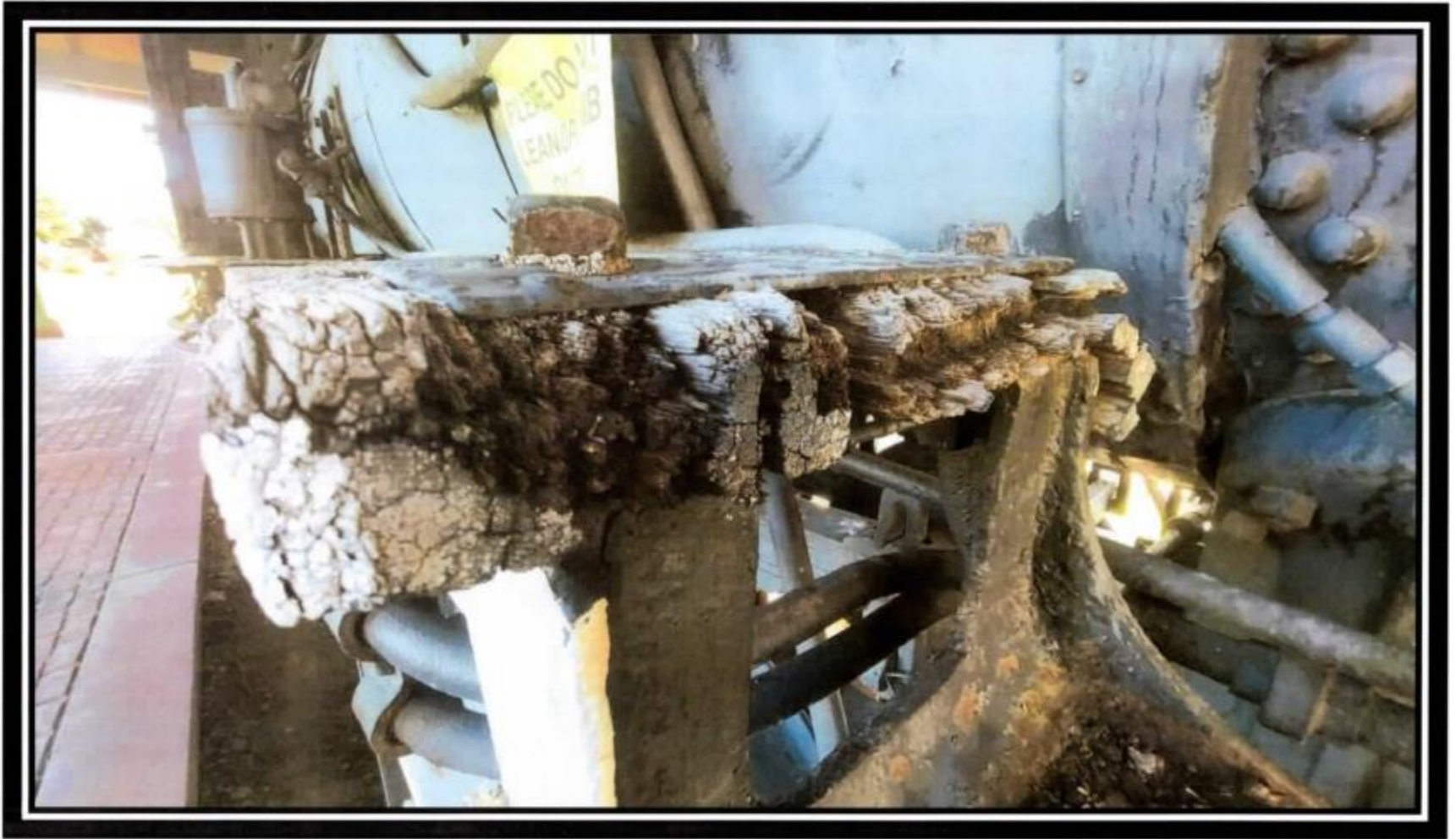
Northern Pacific No. 1031 class L-7 0-6-0 steam engine deteriorating wood.