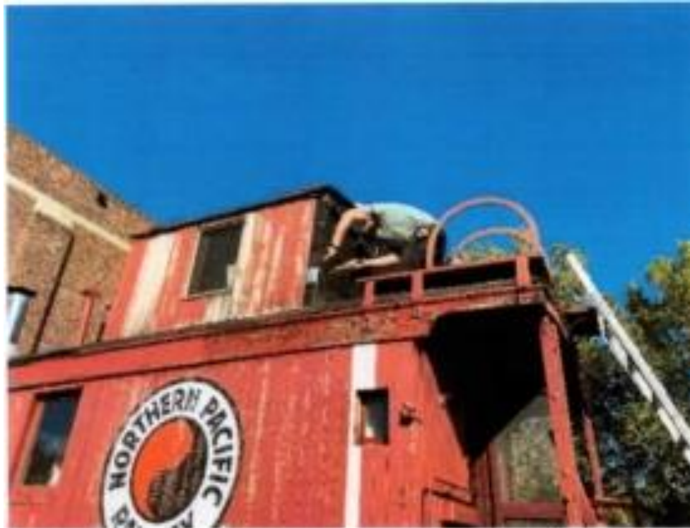
A worker from "The Expert Company" works on the cupola.