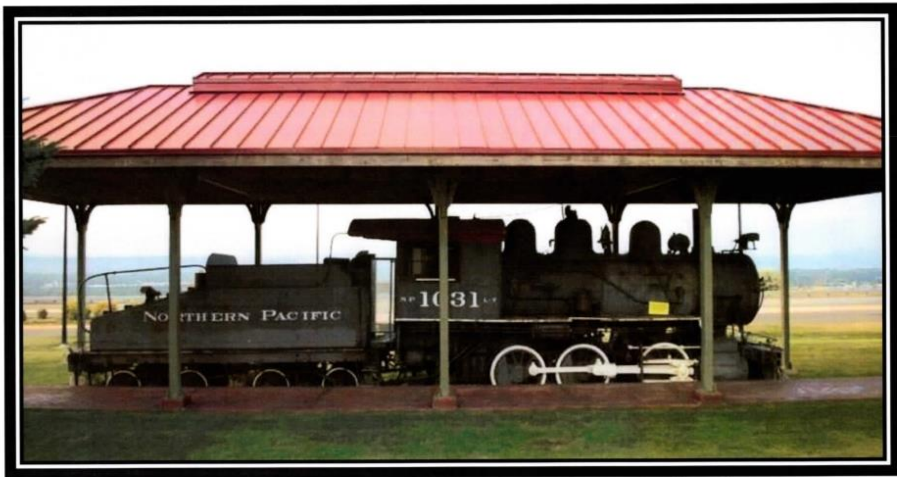
Northern Pacific No. 1031 class L-7 0-6-0 steam engine as it sits today on the grounds of the Yellowstone County Museum. The structure was built around the year 2000 to protect the Trian.