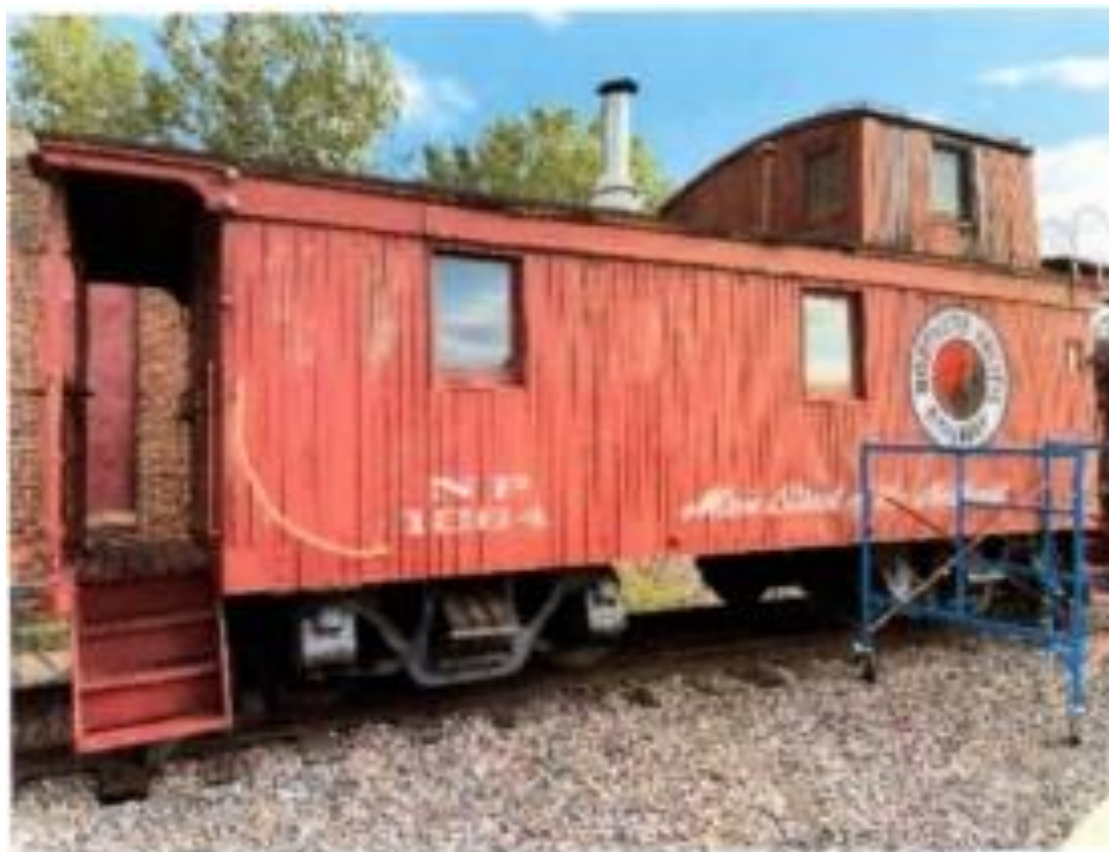
NP 1264 at Jackson Street Roundhouse