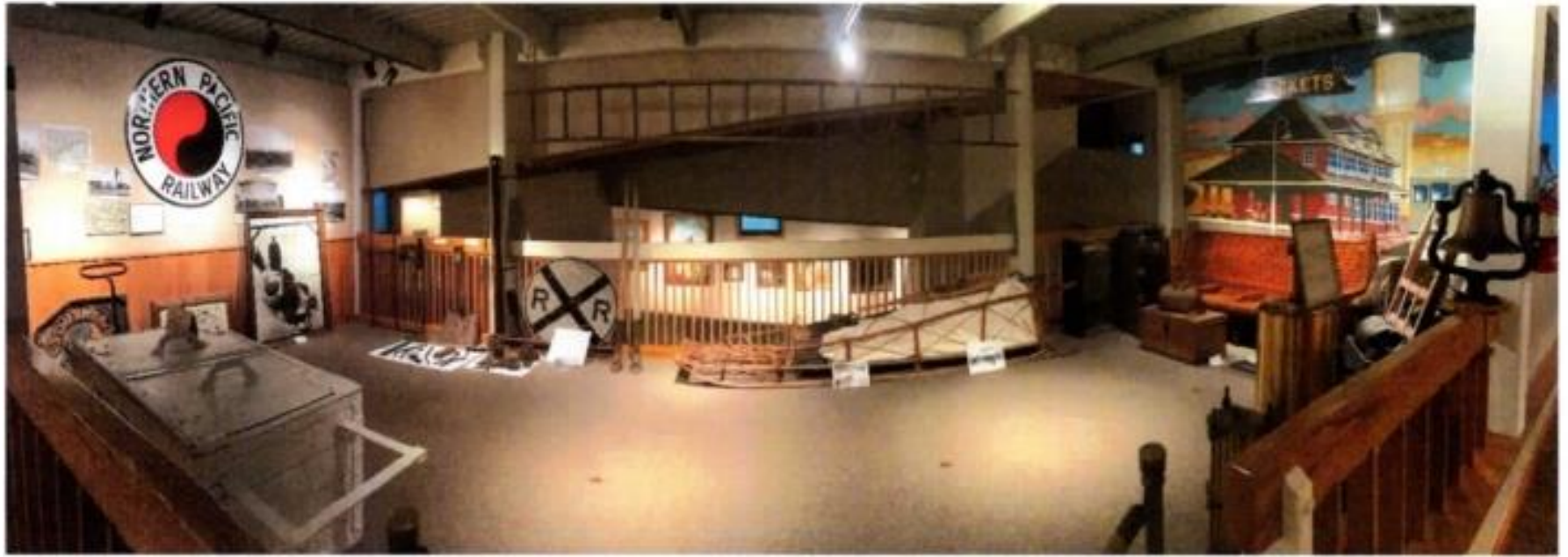
Panoramic View of Exhibit Area