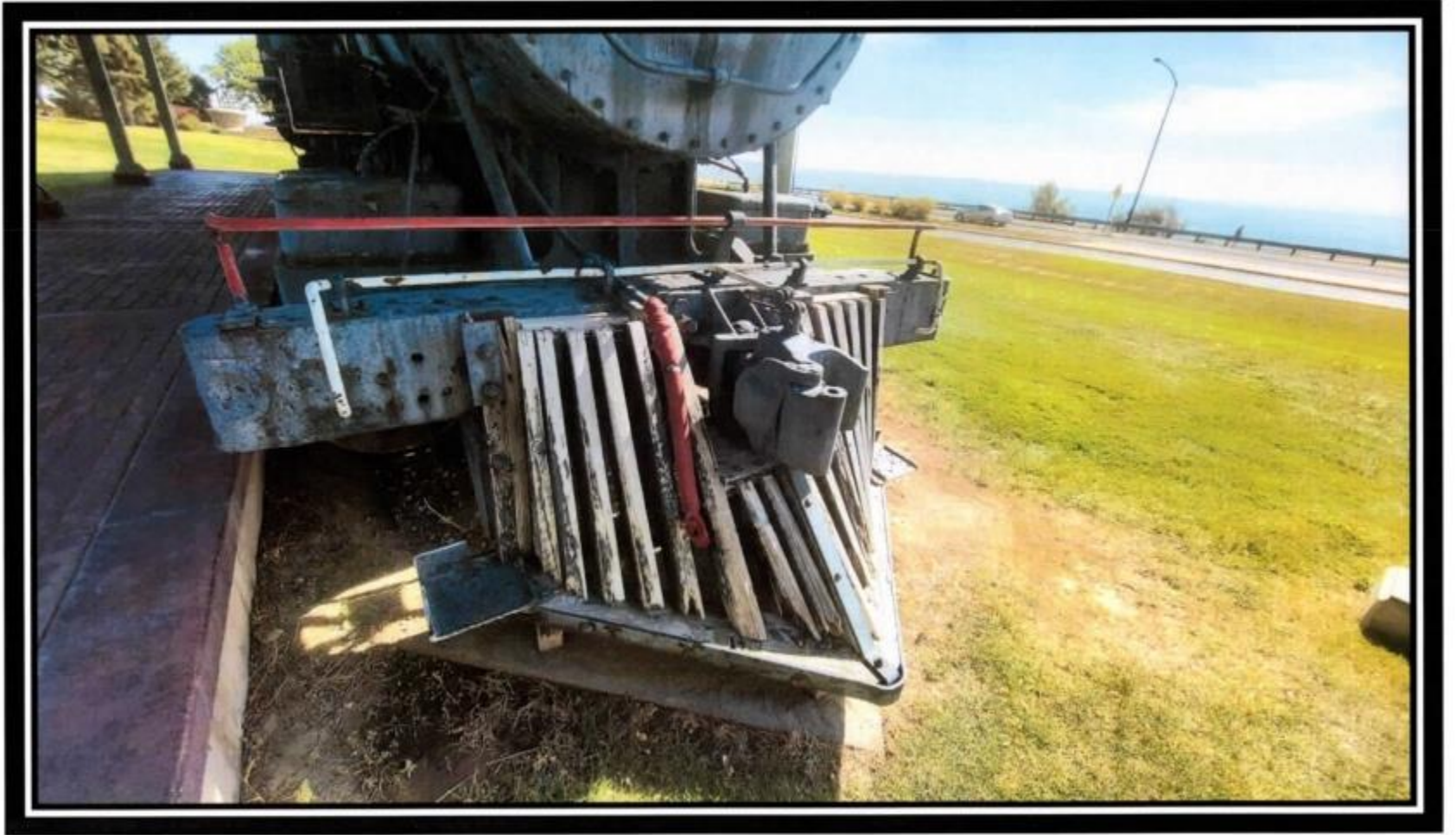
Northern Pacific No. 1031 class L-7 0-6-0 steam engine front view.