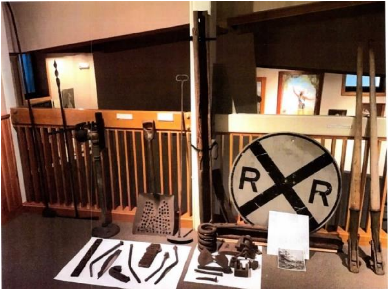
1875 Bridge Collapse Items & Large Tools